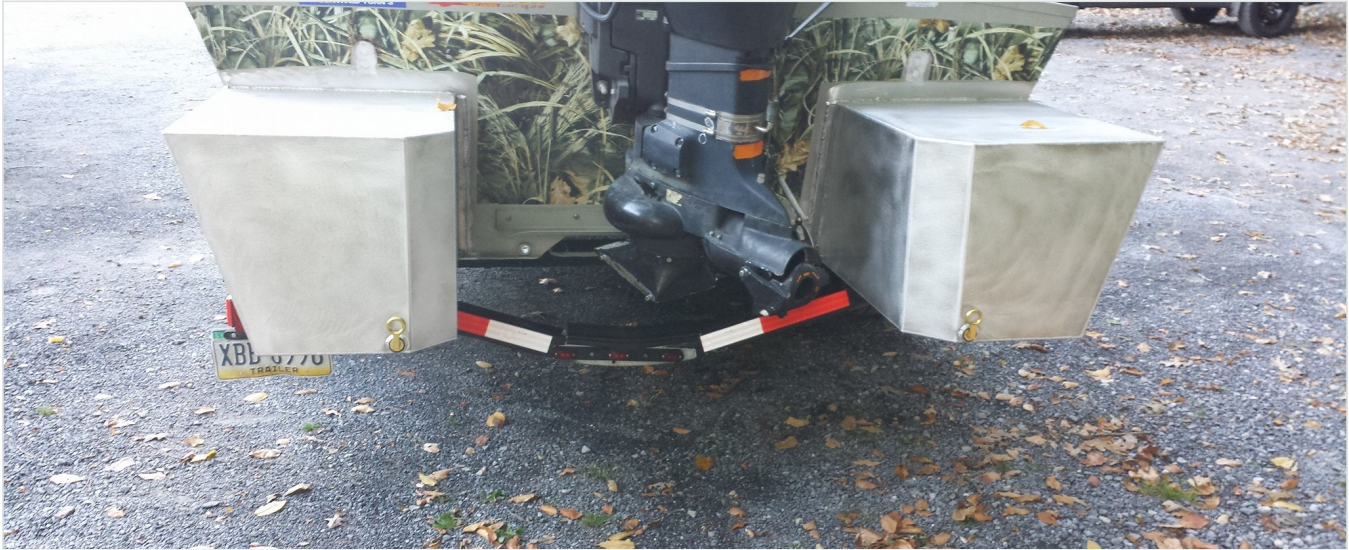
Prior marine aluminum fabrication experience

New LLC. Experienced hands. JOMP is built around practical fabrication experience and a network of skilled welders, fabricators, vendors, finishers, and installation partners.