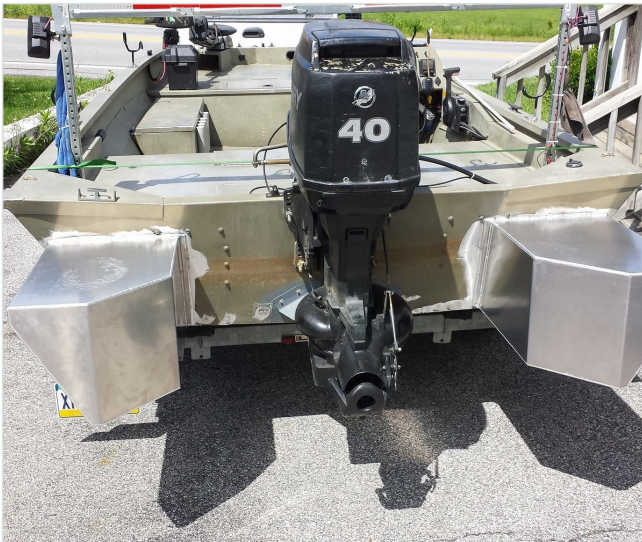
Aluminum boat storage boxes