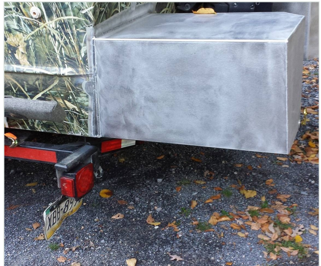
Rod holder tree / marine fabrication