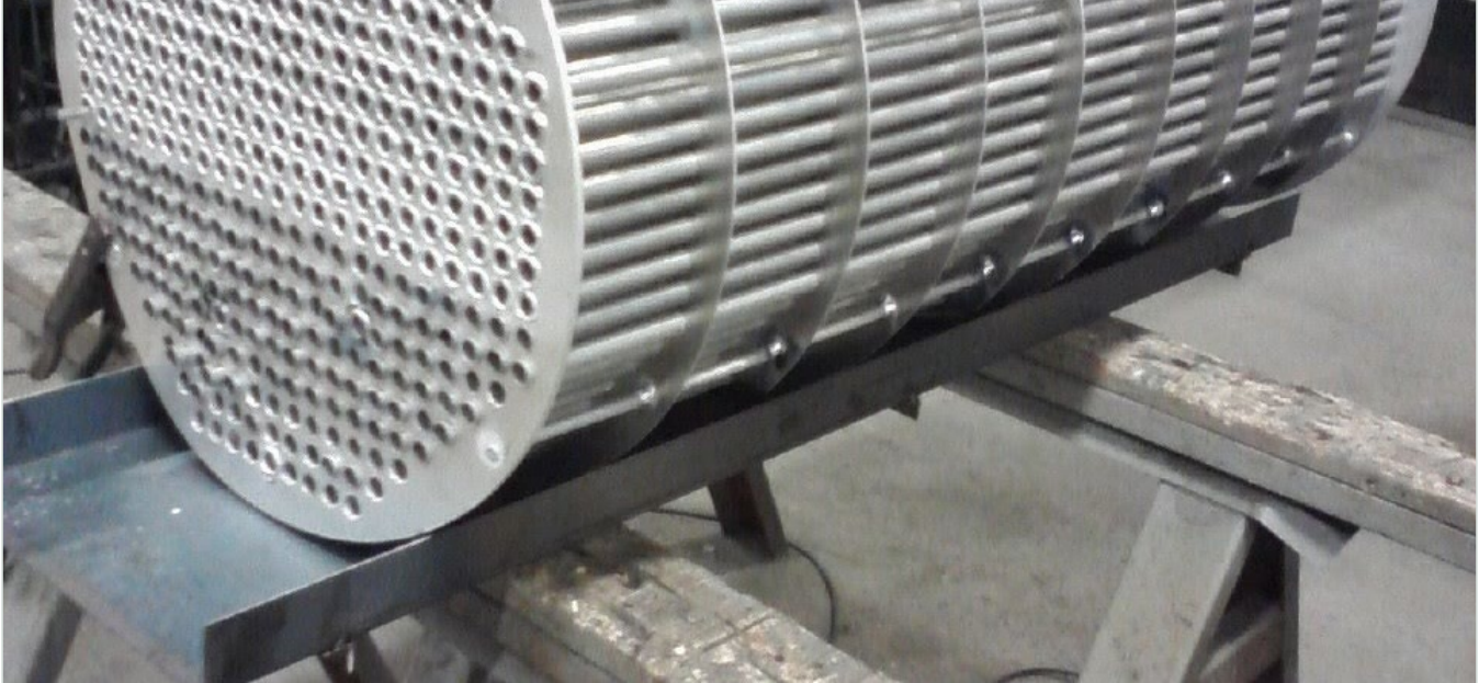
Tube and plate fabrication

Photos shown include prior fabrication examples from experienced people in the JOMP network. These examples show practical capability in aluminum, stainless, tube work, marine components, railings, panels, brackets, and custom fabrication.