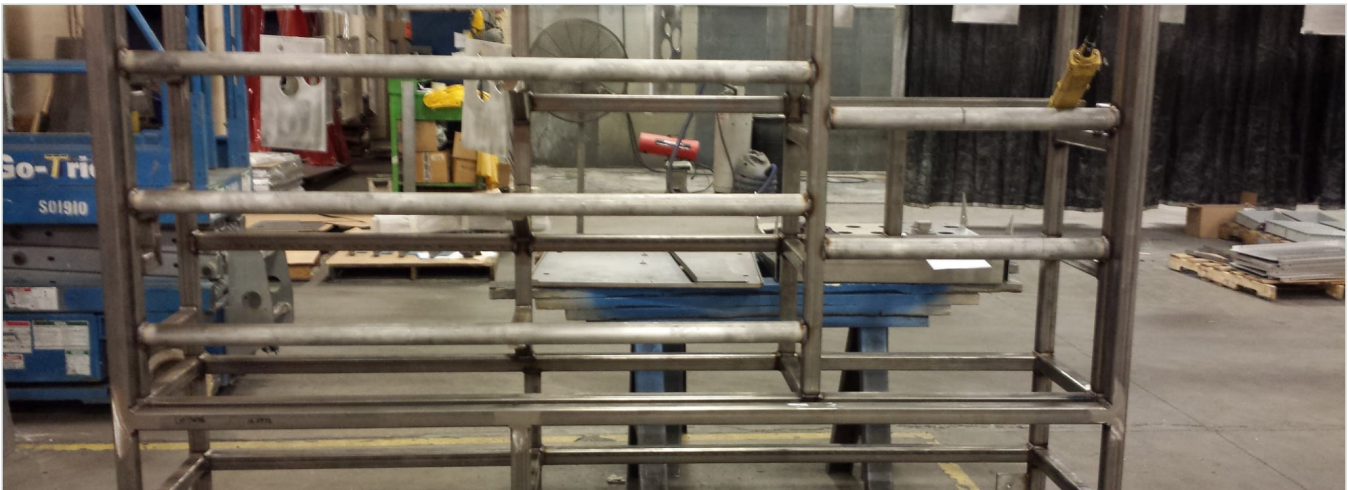
Tube railing / framework fabrication