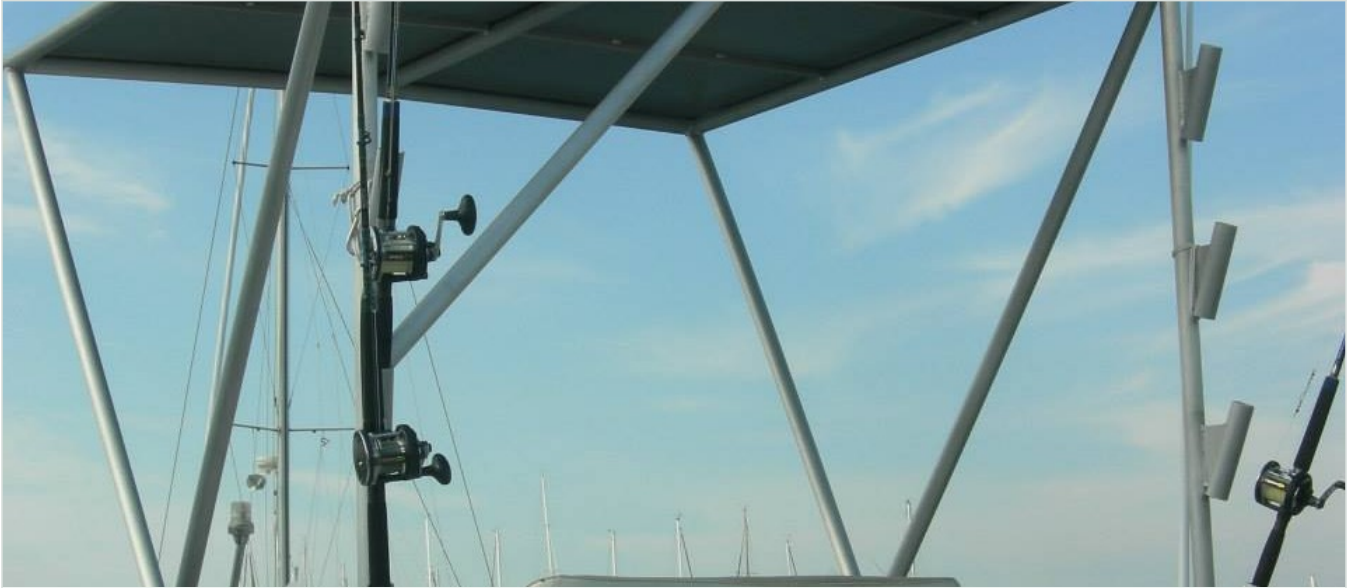
Marine canopy frame with integrated rod holder work

Marine and outdoor work shows fit-up, tube work, aluminum fabrication, storage components, railings, and finished assemblies.