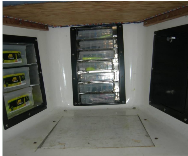
Custom storage / inlaid shelf panels

Ready to review: photos, field measurements, hand sketches, CAD drawings, DXF, STEP files, material specs, quantity, deadline, finish requirements, and install/support notes.